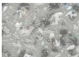
Grey Fusion 4105