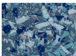
South Sea 4175