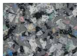
Orient Grey 4135