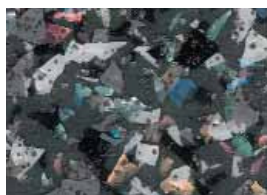
Graphite Pearl 4165