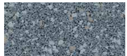
Pearl Granite 4330