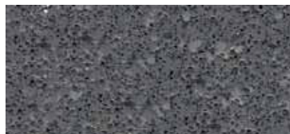
Aurora Grey 4290