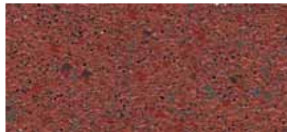
Iron Ore 4340

The Cooking School at Dean Clough, Halifax